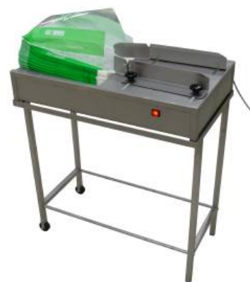
Optional ▶ Frame beneath bagblower