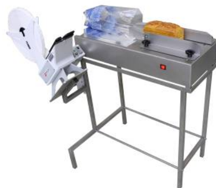
Optional ▶ Closing machine wicket