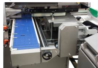
Optional ▶ Automatic bag change system