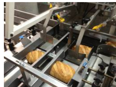
Split and turn system for halves