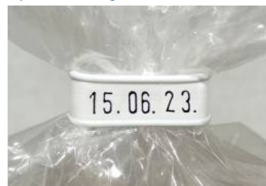
Optional ▶ Date coder