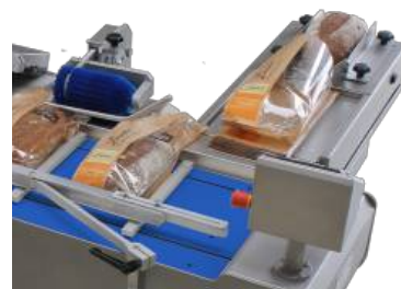
Optional ▶ Bagblower