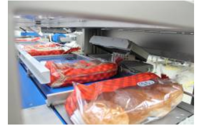
Clipband closing head