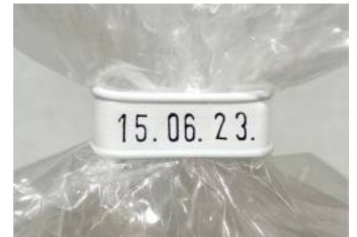
Optional ▶ Date coder