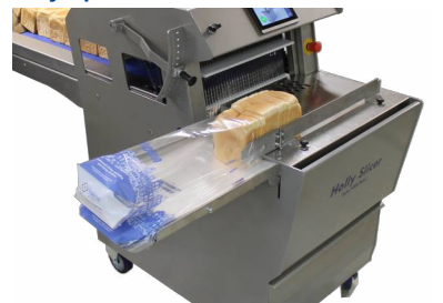
Optional ▶ Outfeed table with bagblower