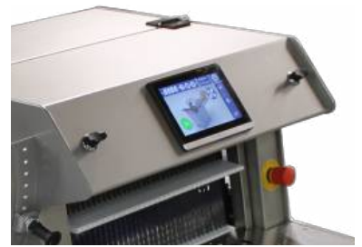
Easy operation with touch screen