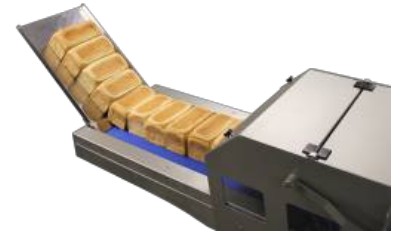
Extending infeed with plate